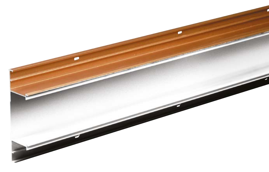
*Please note: non-standard products are made to order and therefore are subject to set up charges and a longer lead time.

We offer a standard range of copper screened products within selected PVC-U perimeter trunking systems which are held in stock. If you have a requirement for products to be copper screened that are not part of our standard range, please contact our Technical Team on +44 (0)1424 856688.*