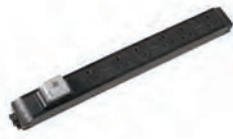
Power feed unit 6 gang indiv fused