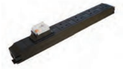
Power feed unit 4 gang indiv fused

Direct feed from tap off lead via 20mm gland hole to connector block with multiple 13A socket outlets