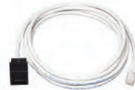
Black Cat 6 module assembly