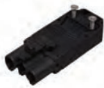
GST 3 pole connector