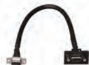
300mm launch lead F/F