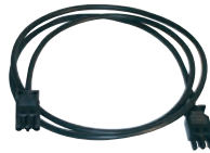
GST18/3 M/F Interconnecting lead