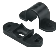
Spacer bar snap saddle