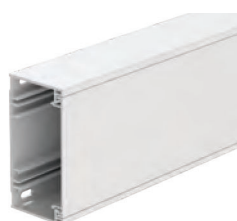
Mono 10 trunking assembly