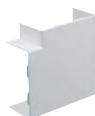
Flat angle cover