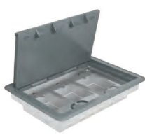
Floor box pre-fitted with 3 x UP632 plates