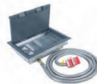
4 compartment CE pre-wired box with 3m tap-off 357 x 257 x 83mm