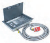
3 compartment CE pre-wired box with 3m tap-off 357 x 257 x 83mm