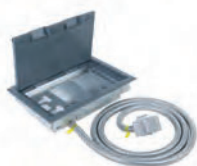
3 compartment standard pre-wired box with 3m tap-off 357 x 257 x 83mm