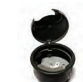
Floor power grommet