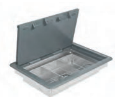
Empty floor box