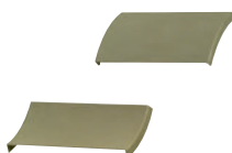
Tray offset cover set