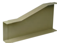
Tray reducer LH base