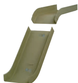
Tray offset base set