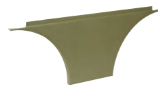
Tray flat tee base (small radius)