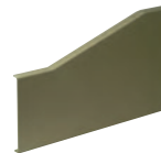
Tray reducer LH cover